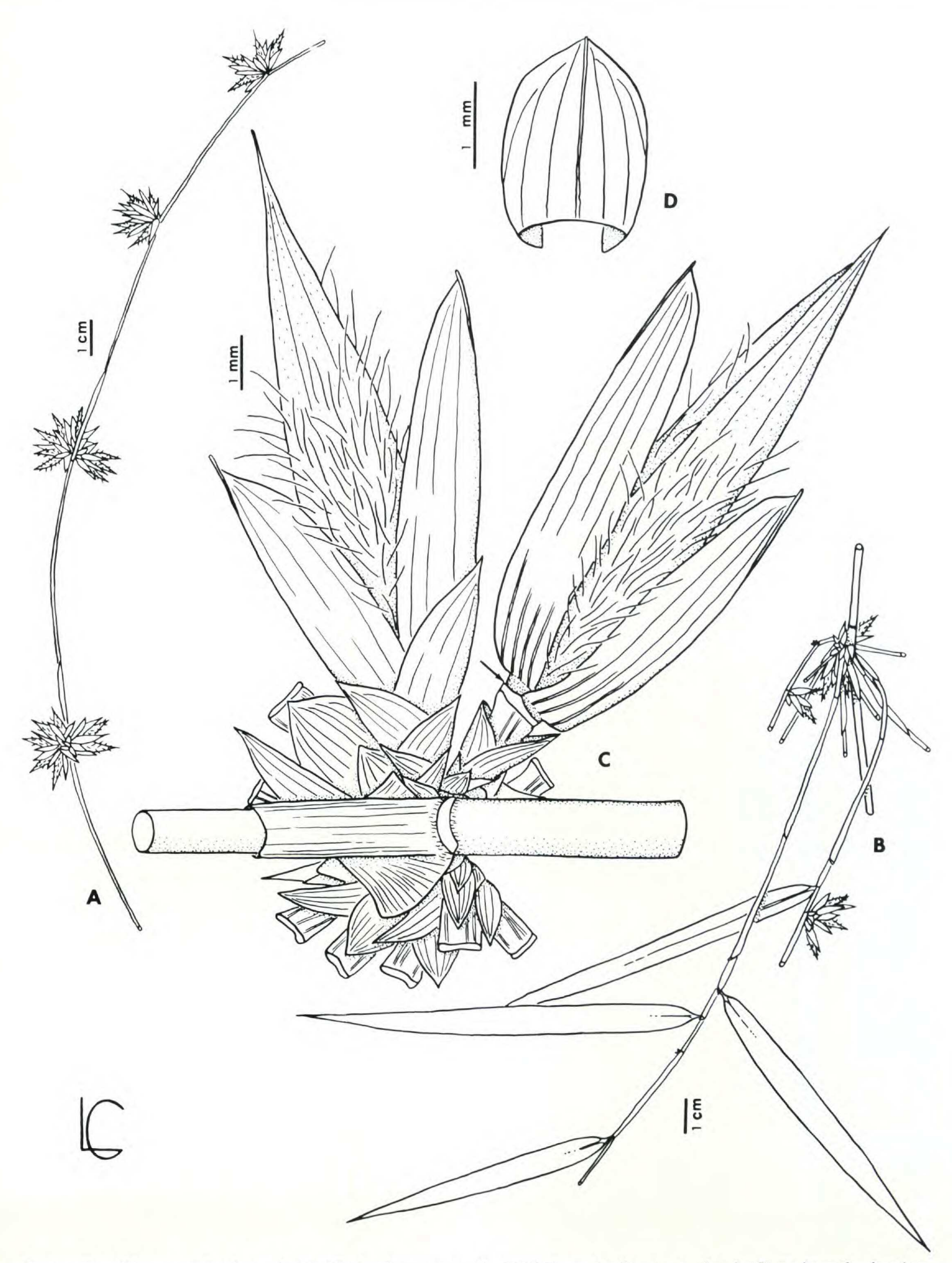
Figure 2. Chusquea barbata L. G. Clark (Gentry et al. 42007). —A. Segment of subsidiary branch showing spikelet clusters. —B. Branch complement with foliage leaves. —C. Detail of one spikelet cluster showing two spikelets; arrow indicates line of disarticulation. —D. Subtending spikelet bract showing the curvature of the nerves.